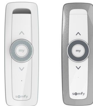
Situo 1 Variation io II

The programming button located at the back of the transmitter allows to memorize the address of the transmitter in one or several receivers. It is the pairing process.