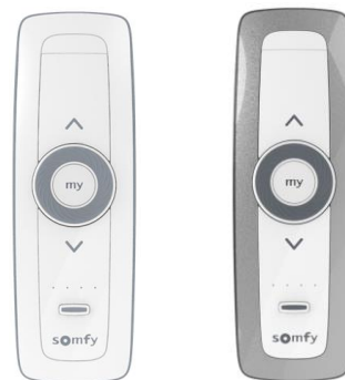
Situo 5 Variation io II A/M